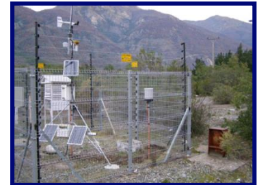
Speedwell Weather Station: Armerillo, Chile installed to support provision of Settlement Data for a large rainfall hedge