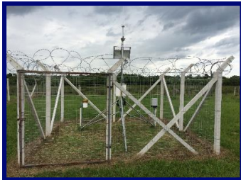
Speedwell Weather Station: Uruguay to support provision of Settlement Data for World Bank – UTE hedge.

Where weather stations themselves are owned by the company taking out the hedge, or, where an NMS operates closely with the national energy company, concerns relating to possible moral hazard need to be anticipated. In this case our role may be extended. This might involve us installing a weather station to verify the readings taken in the primary weather station being used for settlement. However, our standard quality control processes also help verify the data by comparing the primary site to proxies and using other sources such as rainfall radar or interpolated data.